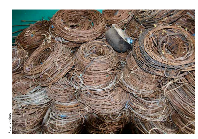
SNARES REMOVED FROM THE SERENGETI.

In <u>Tanzania's Serengeti National Park</u>, one of the most iconic landscapes in Africa, which is under threat from snaring by bushmeat poachers. The grant to Frankfurt Zoological Society will support the park authorities with de-snaring and infrastructure needs.