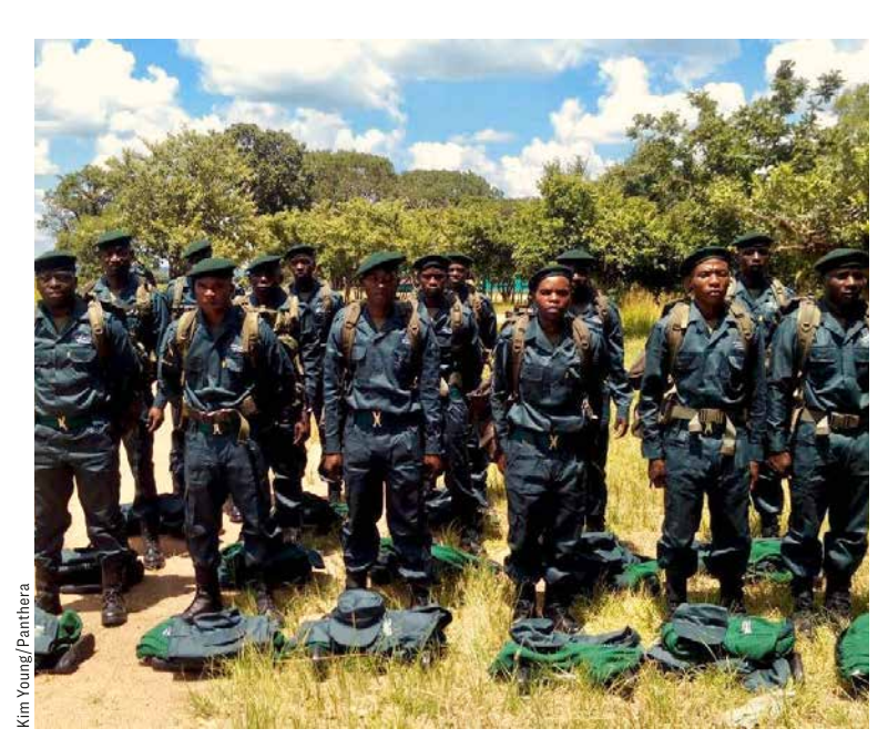
KAFUE ANTI-POACHING COMMUNITY SCOUTS SUPPORTED BY THE LRF.

In Angola's Luengue-Luiana National Park, where only 30 lions remain in the vast 30,000 square mile park. The grant to Panthera will help initiate anti-poaching efforts, with a view to help ing rehabilitate an extremely depleted park such that it can one day support significant lion num bers and a tourism industry that can benefit local communities.