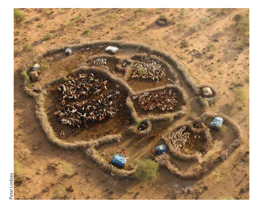
AERIAL VIEW OF A MAASAI HOMESTEAD IN NORTHERN TANZANIA WHERE KOPELION IS INCENTIVIZING LOCAL PEOPLE TO PROTECT LIVESTOCK FROM LIONS.

pastures on which lion prey depends, and measures to reduce conflict between people and lions.