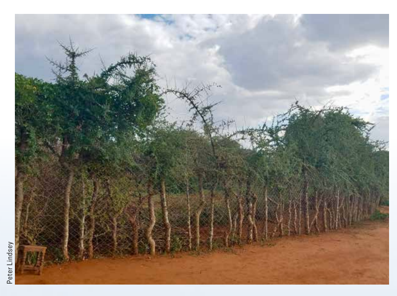
"LIVING WALLS" ERECTED BY AFRICAN PEOPLE & WILDLIFE FOUNDATION PROTECT LIVESTOCK FROM LIONS.