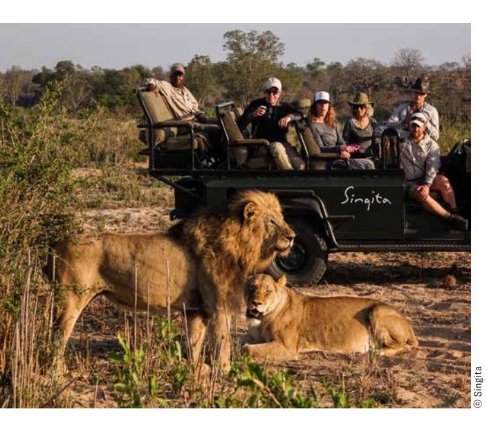
THE LRF IS ENGAGING THE SAFARI INDUSTRY TO ENHANCE THEIR COMMITMENT TO LION AND LANDSCAPE CONSERVATION.

This year, the LRF formed the Lionscape Coalition , a new initiative that is good for lion recovery as well as for business. The Lionscape Coalition allows Africa's top tourism operators to take a leadership position to support on-the-ground conservation work and encourage clients to support the future of lions.