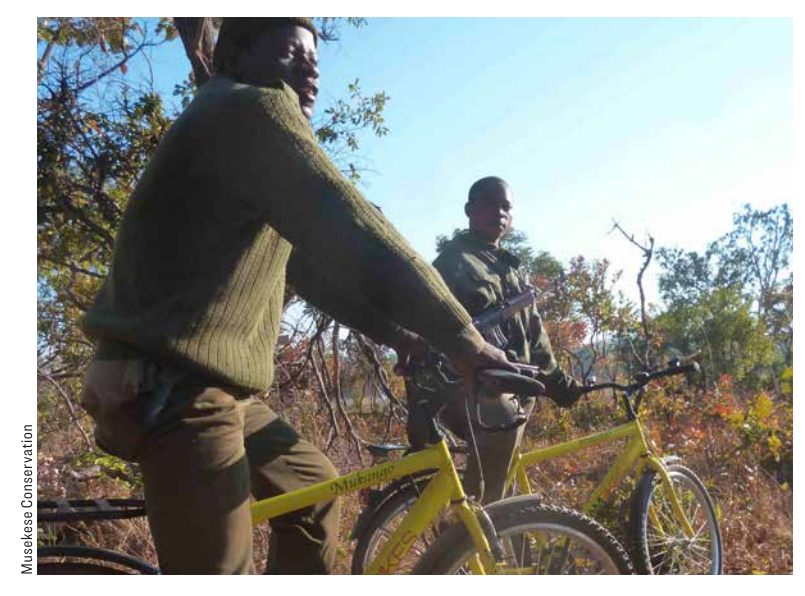
THE LRF IS SUPPORTING MUSEKESE CONSERVATION TO SET UP AN ANTI-POACHING UNIT IN ZAMBIA'S KAFUE NATIONAL PARK.

In Nigeria's Yankari National Park, which holds one of only four known populations of West African lions. The grant to Wildlife Conservation Society will support the law enforcement efforts in the park to tackle threats such as lion poaching and the rampant degradation of the park from illegal livestock incursions.